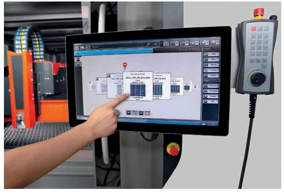
The cutting process is controlled via a 22-inch touch screen

Bystronic UK Ltd Tel: 0844 848 5850 Email: daniel.thombs@bystronic.com www.bystronic.com