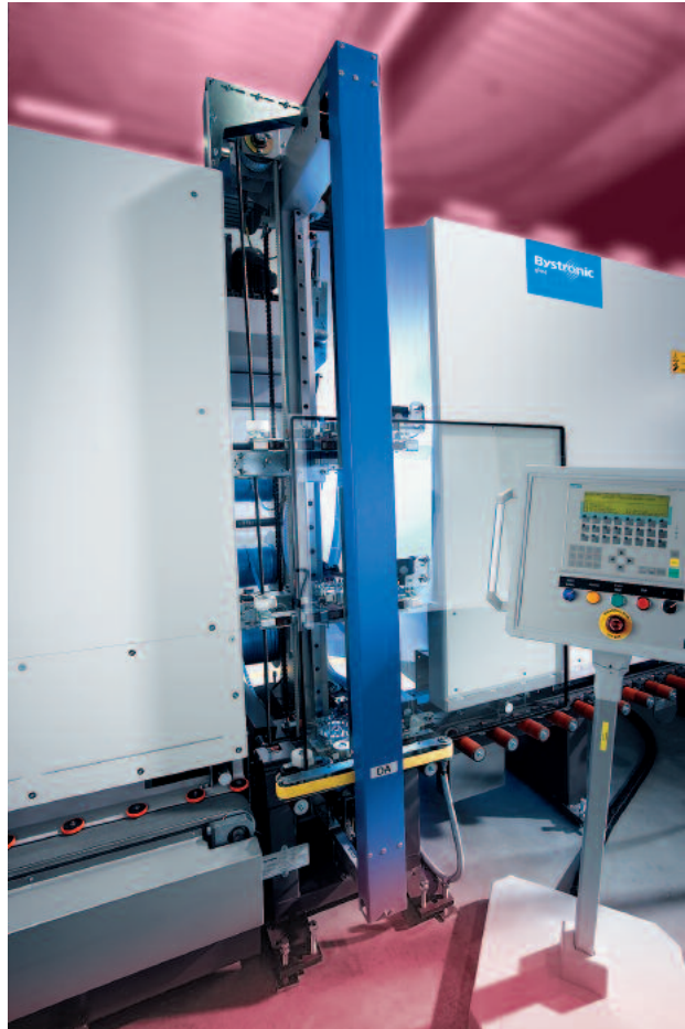
Type DA-HS: Application on I.G. back side