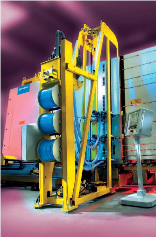
Type DA-VS: Application on I.G. front side